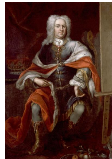
John Brydges, First Duke of Chandos