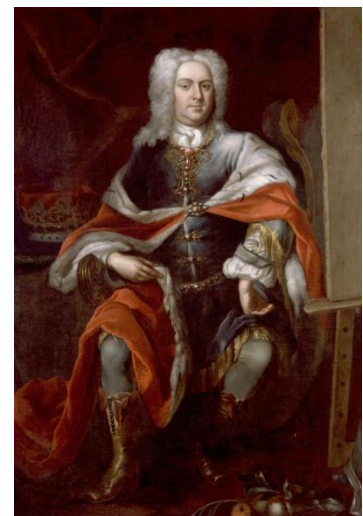
John Brydges, First Duke of Chandos